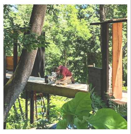
Virginia Tech architectural student on the job building the observatory.