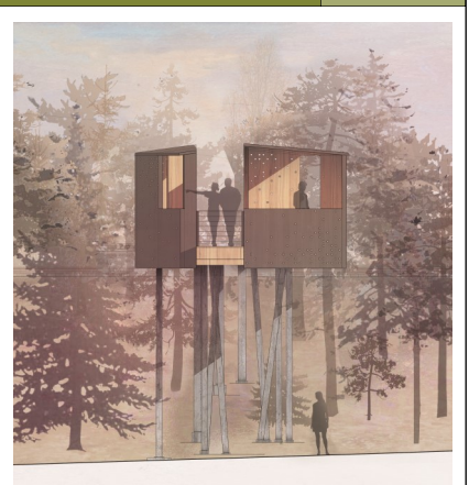
Architectural Rendering of Observatory.

Visitors can view the Norfolk Southern rail line to get a peek at the "iron horses" as they travel through Radford. The observatory is open dawn to dusk daily.